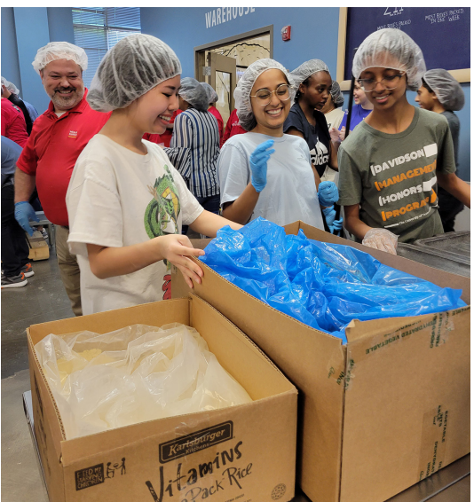
DMHP helped pack more than 17,000 meals at Feed My Starving Children in Richardson.