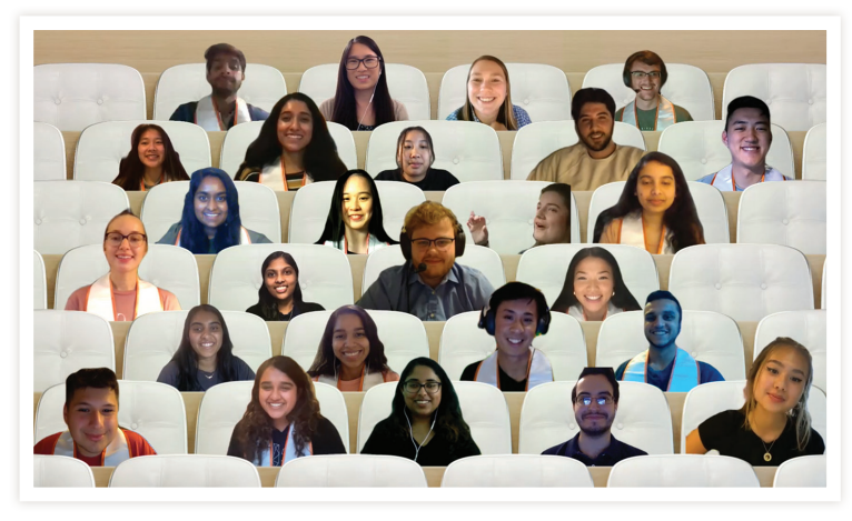
DMHP hosted a virtual celebration in April 2021 to honor Fall 2020 and Spring 2021 graduates.