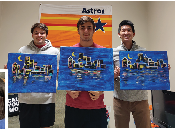
DMHP students expressed their creativity by participating in a virtual class led by Painting with a Twist in Spring 2021.