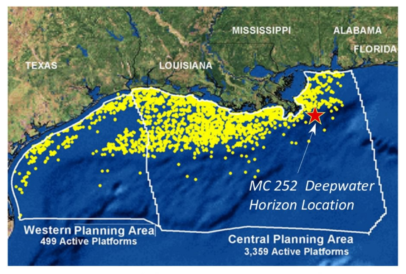
Figure 1. Mississippi Canyon Block 252 Location Map. From U.S. Minerals Management Service