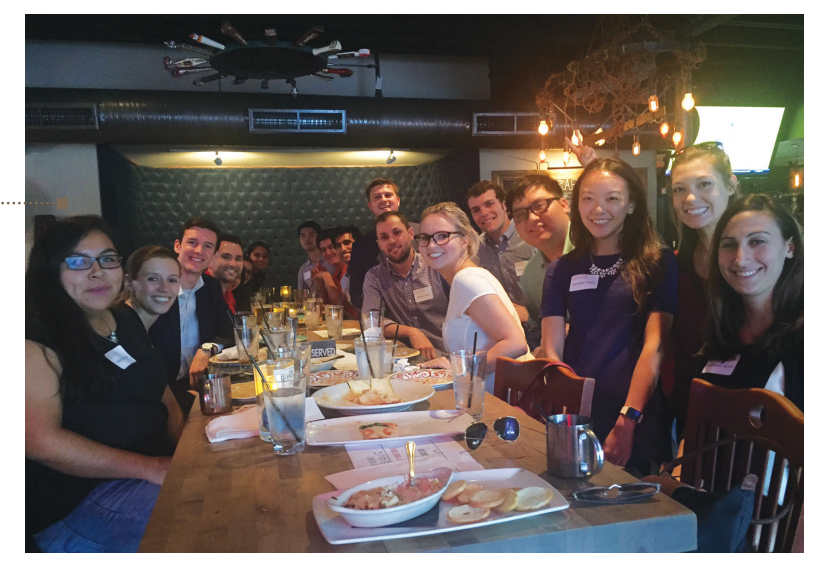
DMHP graduates from 2006 through 2016 attended the fall event of the DMHP Alumni Affinity Chapter in September 2016 at Nickel & Rye in Dallas.